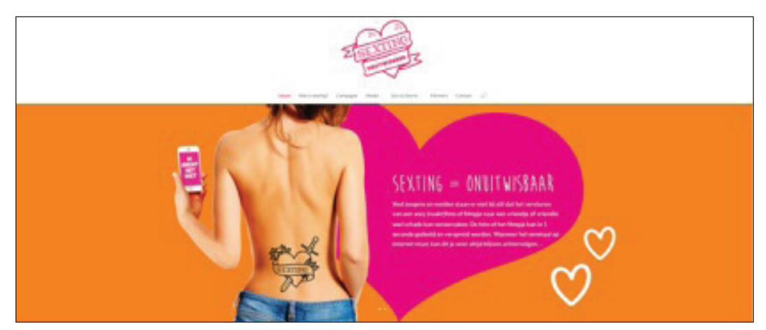
From the website www.onuitwisbaar.nu (onuitwisbaar can be translated as "indelible" or "cannot be erased").

international treaties and agreements prevails? Victims are probably not aware of their rights as defined in international treaties. The international human rights treaties are also probably not foremost in the minds of the mediators. So who is bringing this perspective into the mediation?