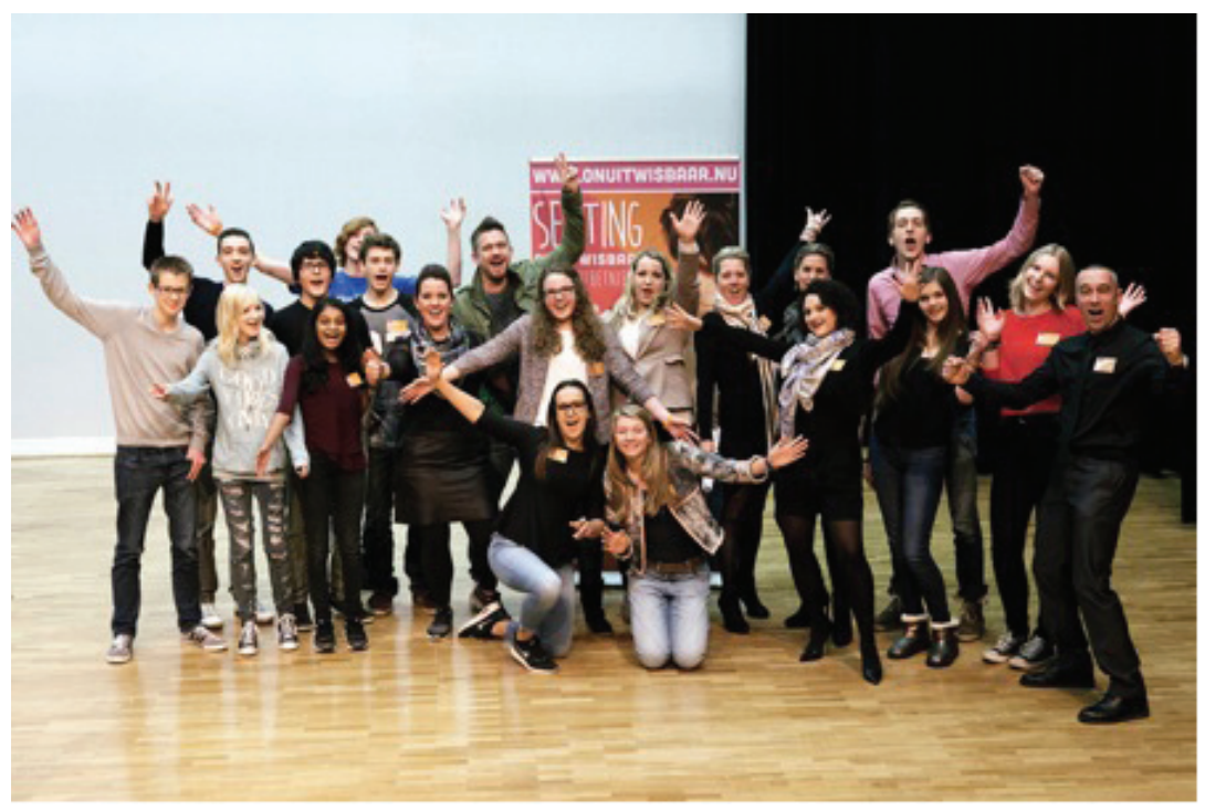
The "changemakers" of WE CAN Young Tilburg behind www.onuitwisbaar.nu.

In November 2014 in Amsterdam, the police, together with the vice squad and the organisation Qpido, started a series of 50 educational meetings for parents, teachers and professionals on sexting and grooming.